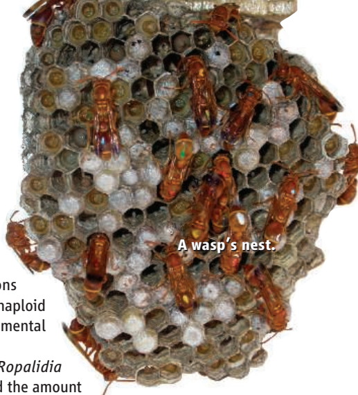
A wasp's nest.

Sen and Gadagkar investigated whether males of the Indian wasp Ropalidia marginata would feed larvae, by manipulating the presence of females and the amount of food nearby. When food supplements were available and when females were missing, males were able to provision larvae at a frequency similar to that observed for females. It appears that under normal circumstances, males do not have enough access to food or are prevented from feeding larvae by females. Thus, the capacity to feed larvae is common to both sexes, and the mechanism preventing males from doing so may be behavioral rather than genetic or developmental. — AMS